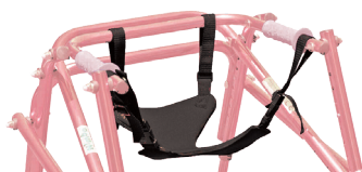
Soft Seat Harness

Adjustable padded pelvic support assists weight bearing, properly positions user's pelvis and provides freedom of movement.