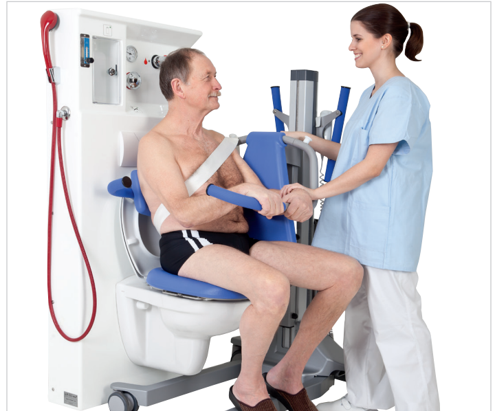
Easily used in combination with a seat lift for visits to the toilet.