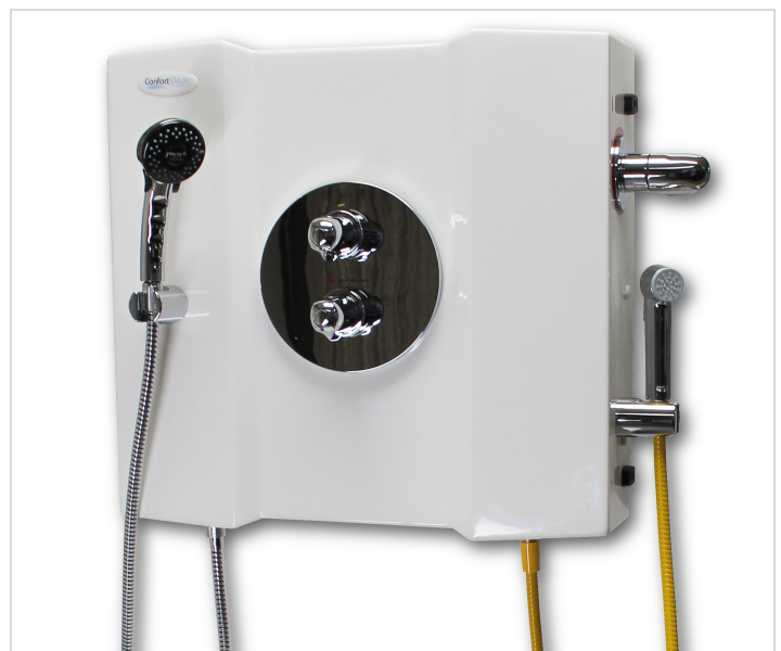
CPC1000 shower panel with disinfection system.