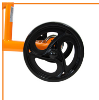
8" Solid Rubber tires are non-marking and maintenance free