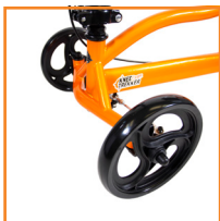
Automotive style tie rod steering system offers maximum stability and improved safety