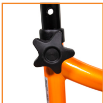
Knee stem is height adjustable for users 4'6" - 6'6"