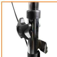
Handle bars are height adjustable 33" - 42"