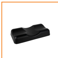
2" Premium Contoured Knee Pad