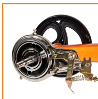
Rear Drum brakes increase the longevity of the tire and requires less maintenance than traditional systems