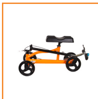
Folds for easy transport