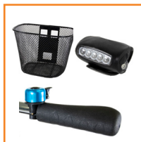
Basket, LED Light and bell included